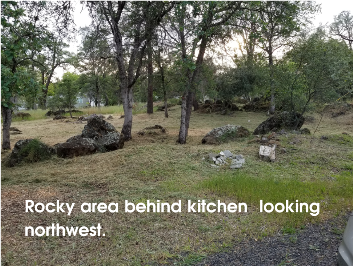
Rocky area behind kitchen looking northwest.