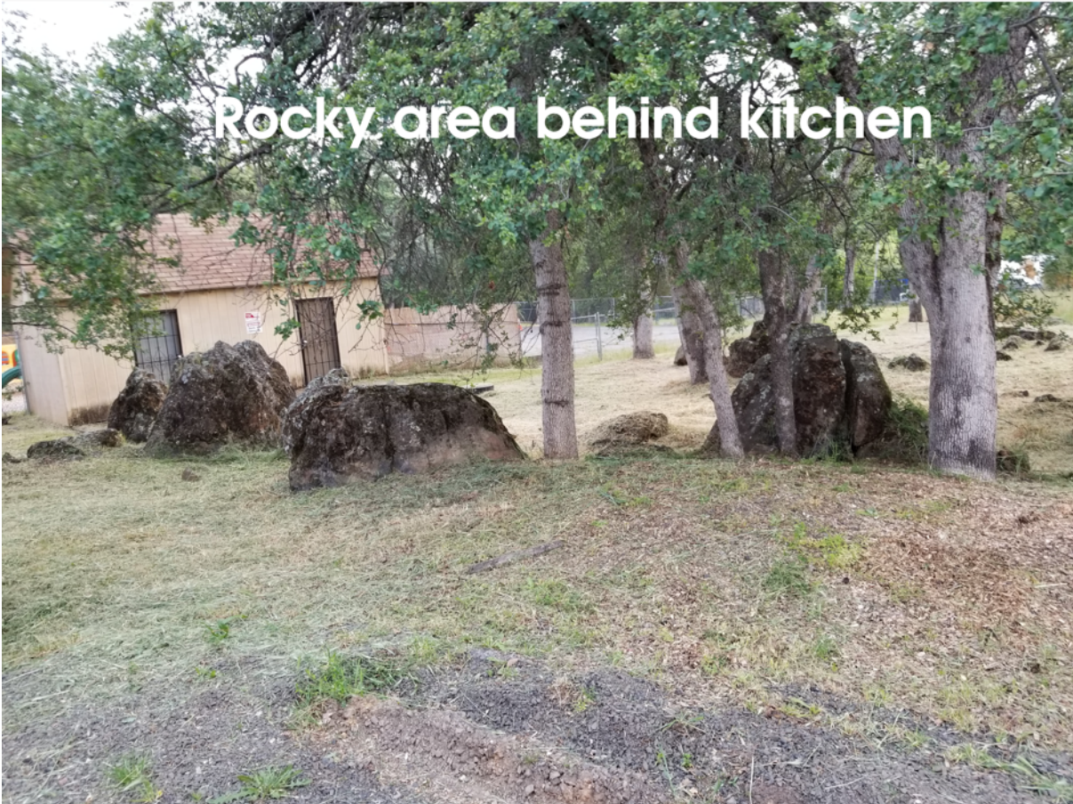
Rocky area behind kitchen