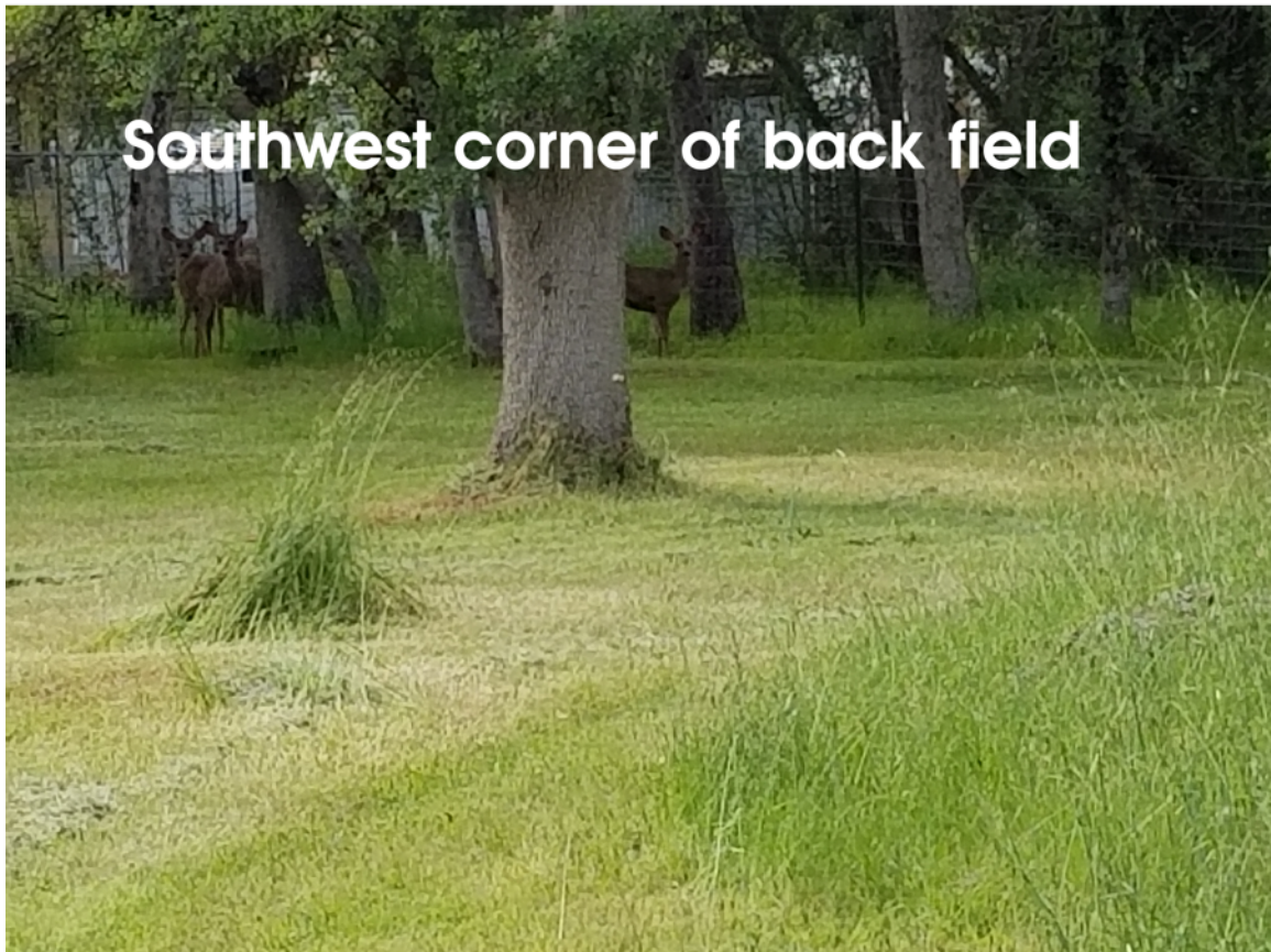
Southwest corner of back field