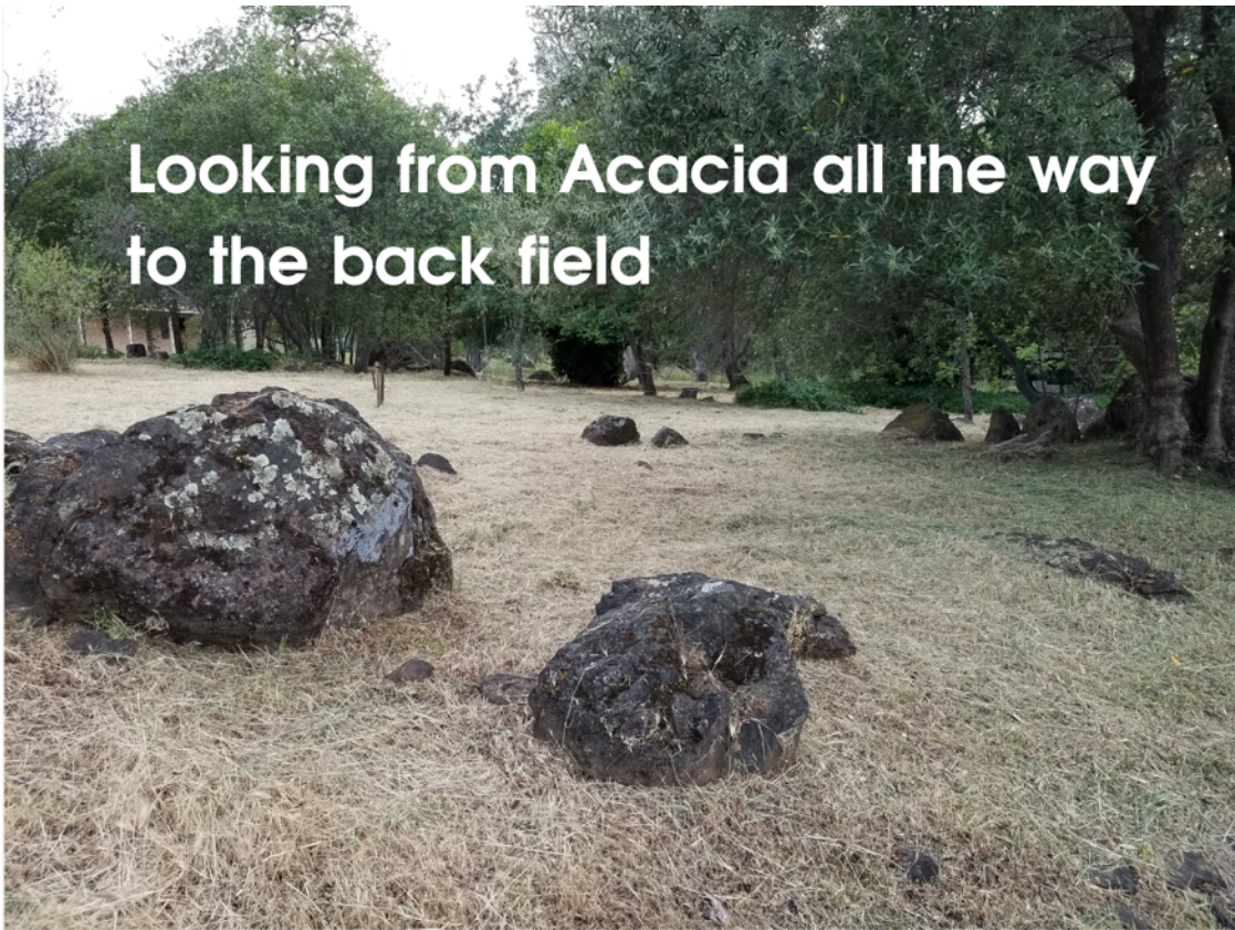
Looking from Acacia all the way to the back field