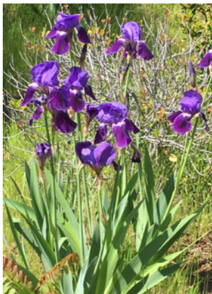
Gift from Dorothy Wise